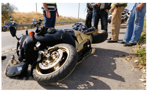
SEE PAGE ONE

For comments, questions and to update your information or remove yourself from our mailing list email us at info@sherylburke.com. We love to hear from you!